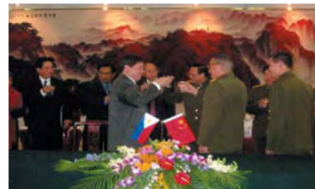
Defense Minister Cao Gangchuan hosts dinner for DND Secretary Cruz at BaYi Bldg on 8 November.

The visit is Secretary Cruz's first foreign visit since he assumed his current position. Aside from official meetings in Beijing, the Secretary also visited the Beijing Military Command, Shaanxi Provincial Military Command, Chengdu Military Command, and the Shanghai Naval Logistical Base.