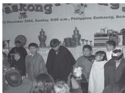
Filipino children re-enacting the Nativity Scene