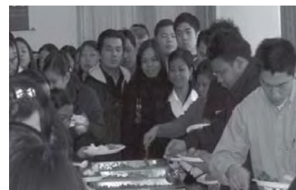
Kababayans lining up for yummy food.

Address: No. 23 XiuShui Bei Jie, Jianguomenwai, 100600 Beijing, People's Republic of China Trunklines: (10) 6532 1872, 6532 2451, 6532 2518 Fax No: (10) 6532 3761 E-mail: beijingpe@cinet.com.cn www.philembassy-china.org